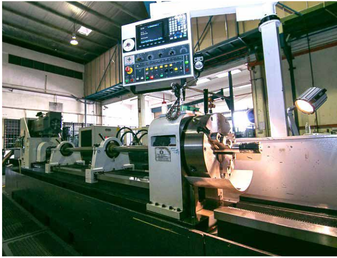
DEEP HOLE DRILLING MACHINE

Our Deep Hole Drilling/ Boring machine delivers quick and precise high aspect ratio hole drilling.